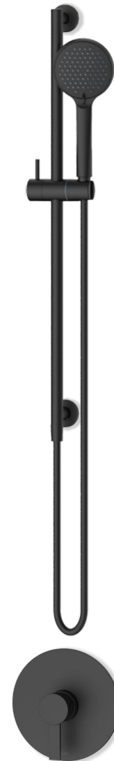
Matte Black (MB)