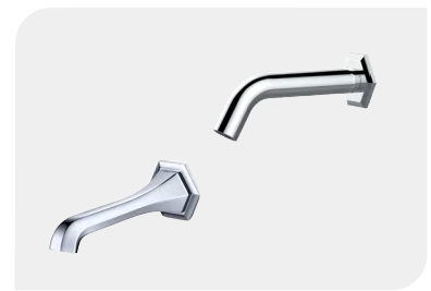
FP6034034 CP $155 PN $189 Tub Filler