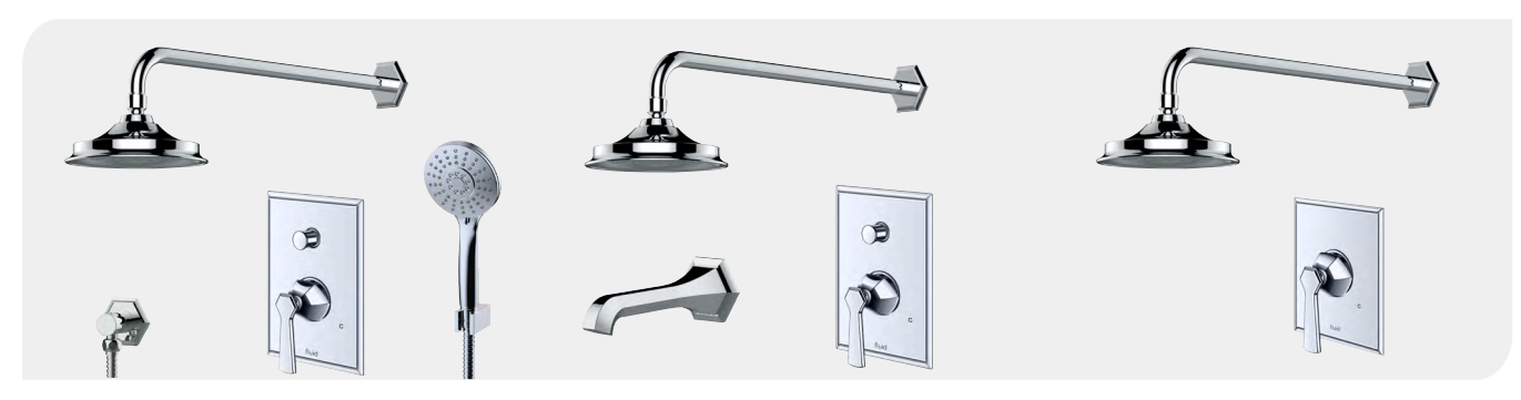
F1741T – CP $550 PN $655 Symmetry Shower with Handheld Trim Package*

Includes: Cover Plate with Handle, 20" Shower Arm, Rain Shower Head, Handheld Shower with Holder, Wall Outlet, Hose