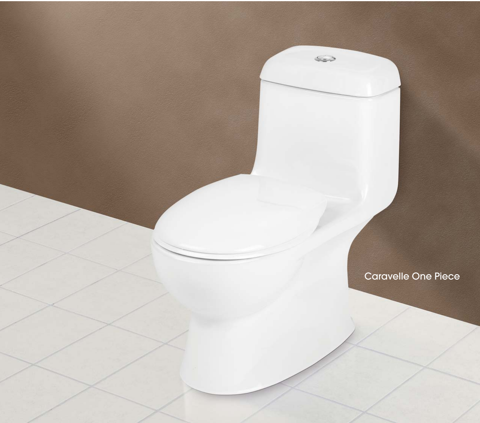
Caravelle One Piece

1.6/0.8 gpf (6/3 l) water saving Dual flush high efficiency toilet