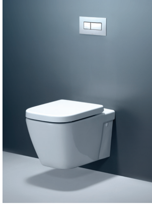
Cube Invisi™ Series II